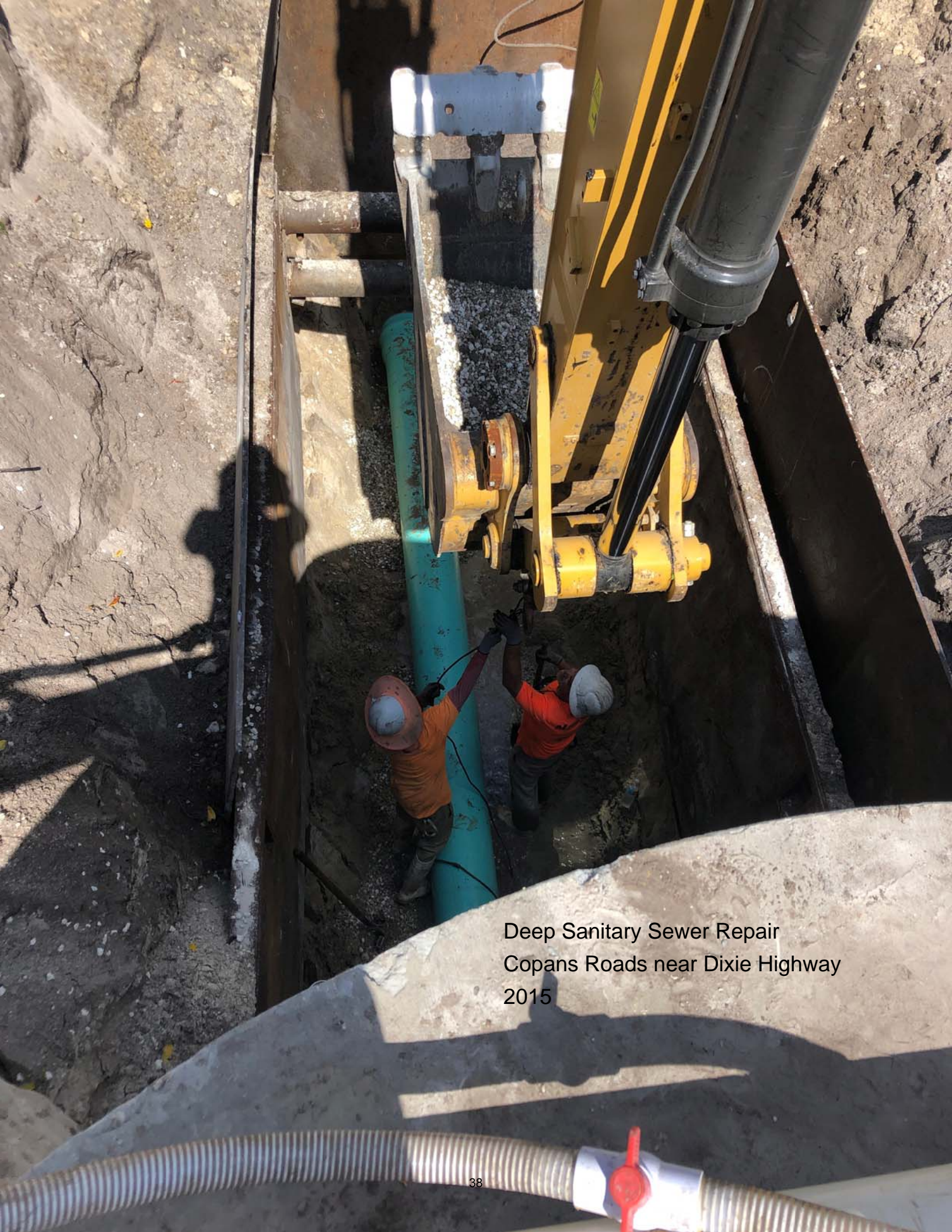
Deep Sanitary Sewer Repair Copans Roads near Dixie Highway 2015