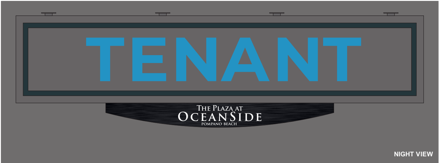
A Hanging Backplate w/ Face Lit Channel Letters, ReverseLit Channel Border & Illuminated Blade - NIGHT VIEW QTY (3) Scale: 1/2" = 1'-0" Display Sq. Ft.: 48.57