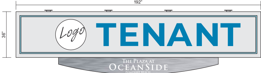
SIGN TYPE B