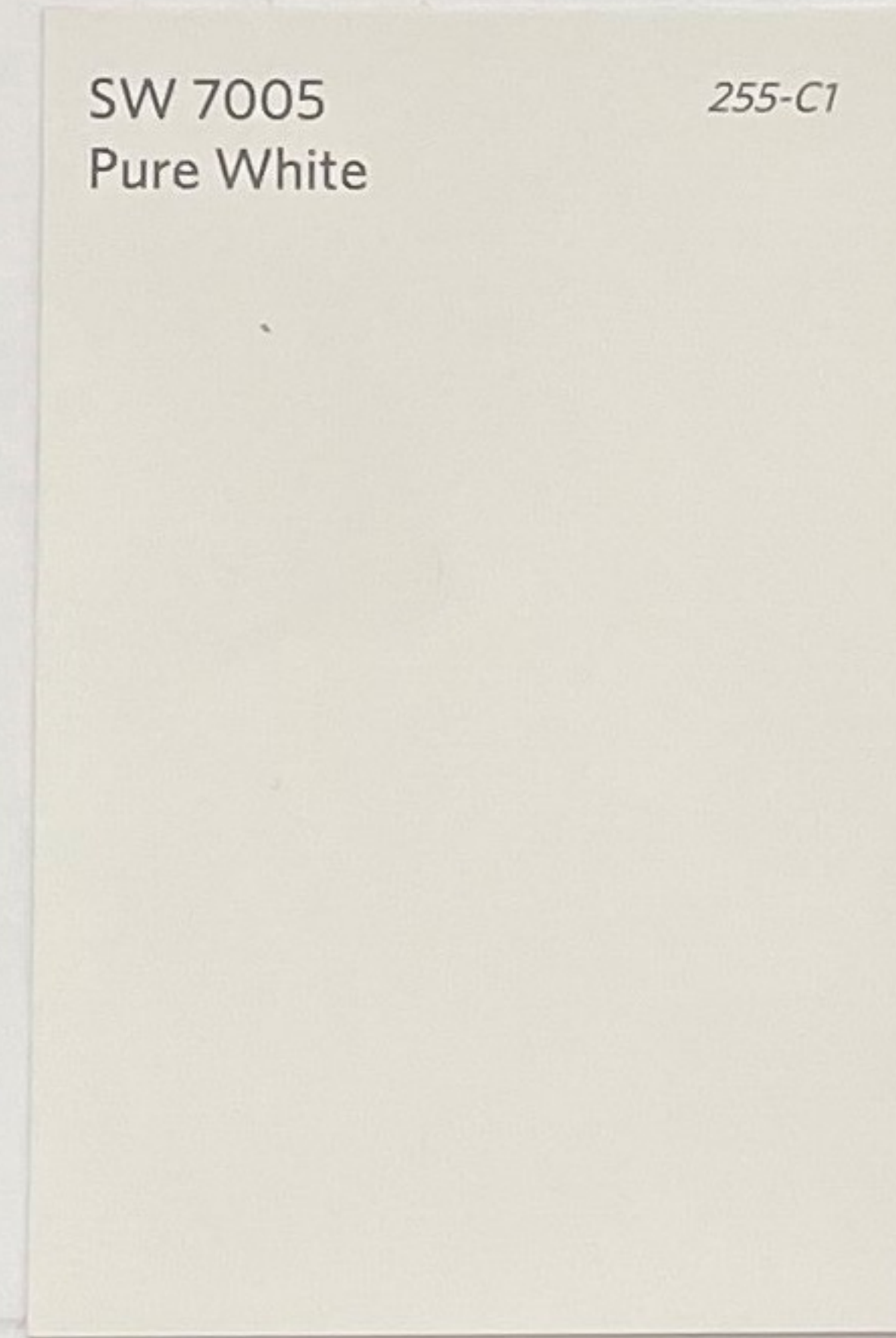
SHERWIN WILLIAMS SW 7005 PURE WHITE