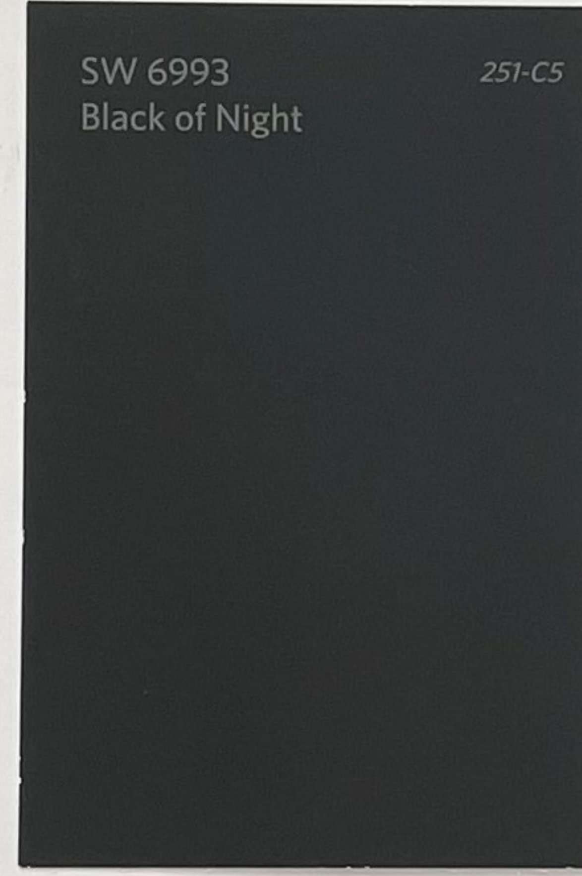
SHERWIN WILLIAMS SW 6993 BLACK OF NIGHT