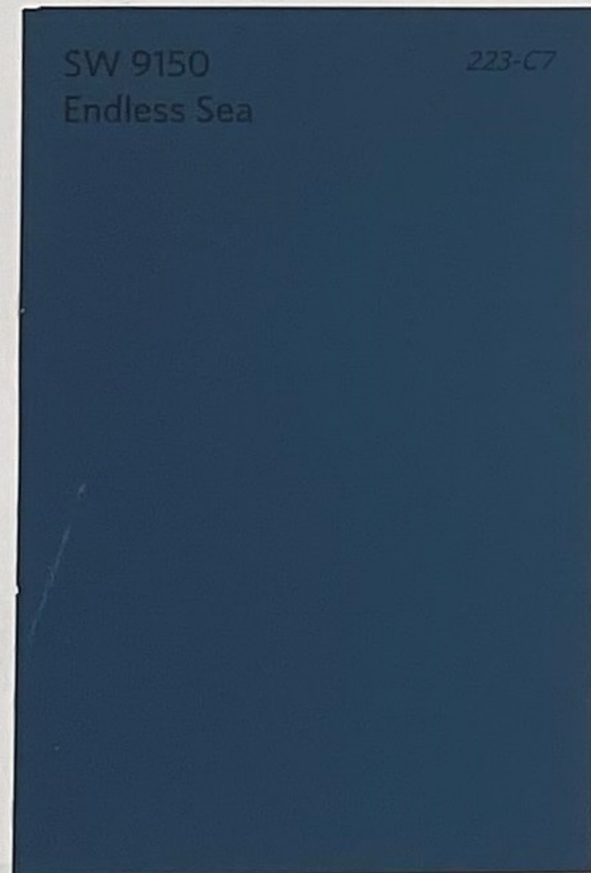
SHERWIN WILLIAMS SW 9150 ENDLESS SEA